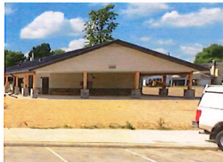
Schoolhouse Park B (North)