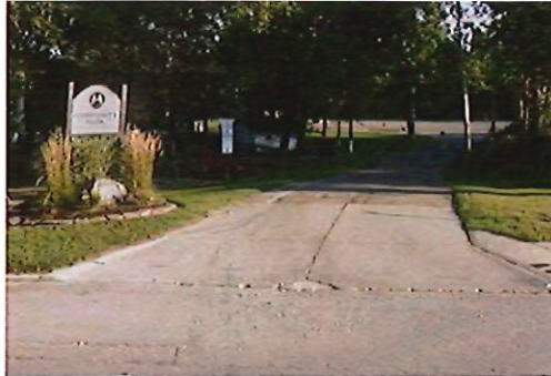
Community Park Large Shelter