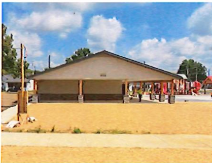
Schoolhouse Park A (South)

The Village of Covington has three shelters that community members can rent.